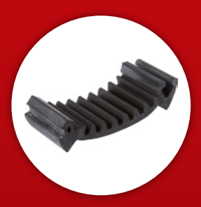
Toothed clip rings