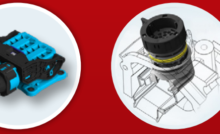
Gearbox connecting solutions