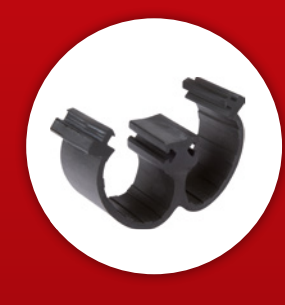
Double-toothed clip rings