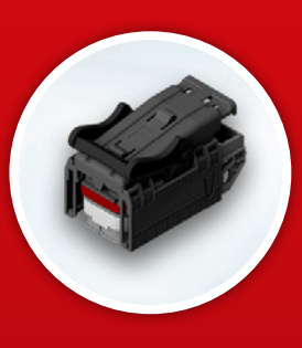
High-density connector systems