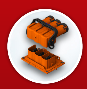
High-voltage connector systems